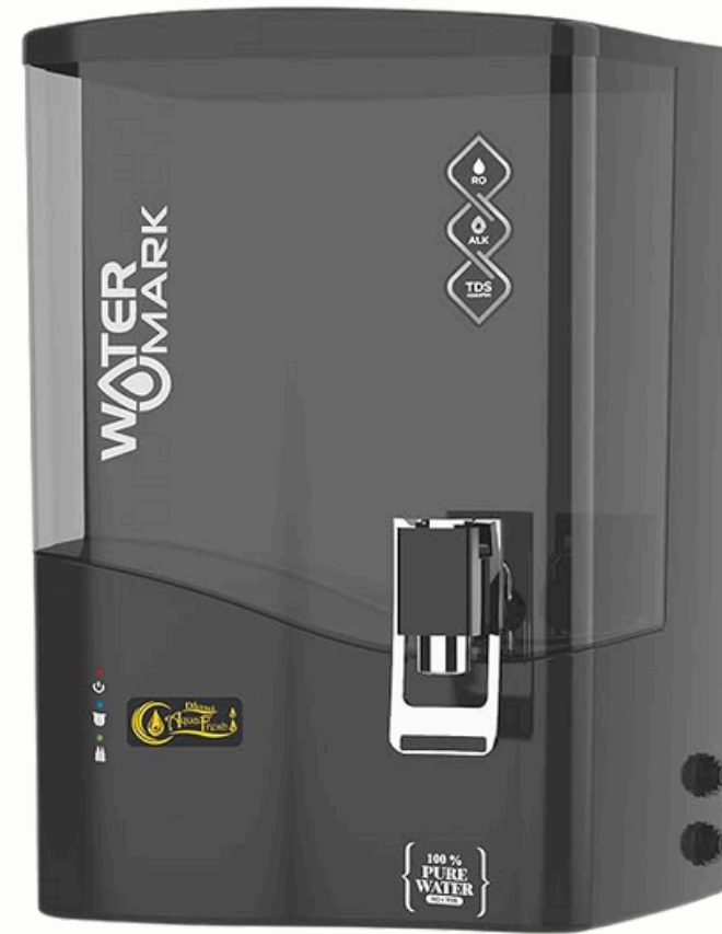
Water Mark (Black)