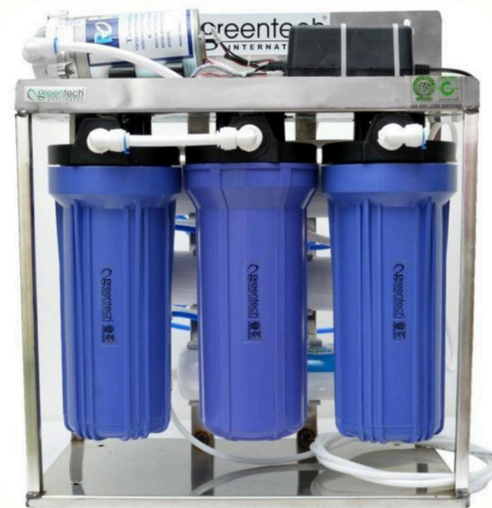
25 LPH - SS KIT