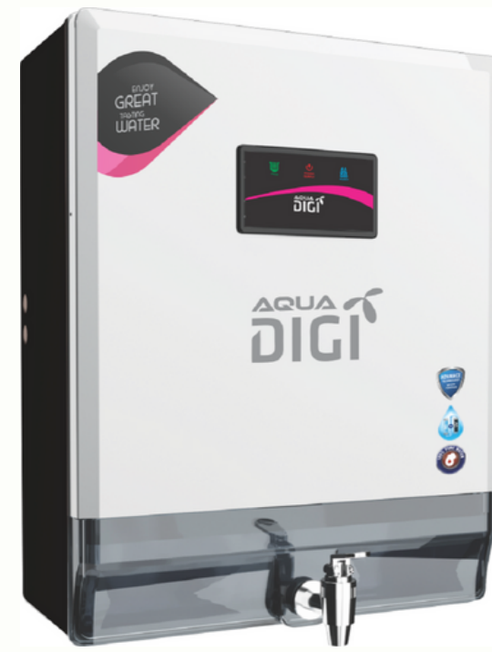
AQUA DIGI WHITE