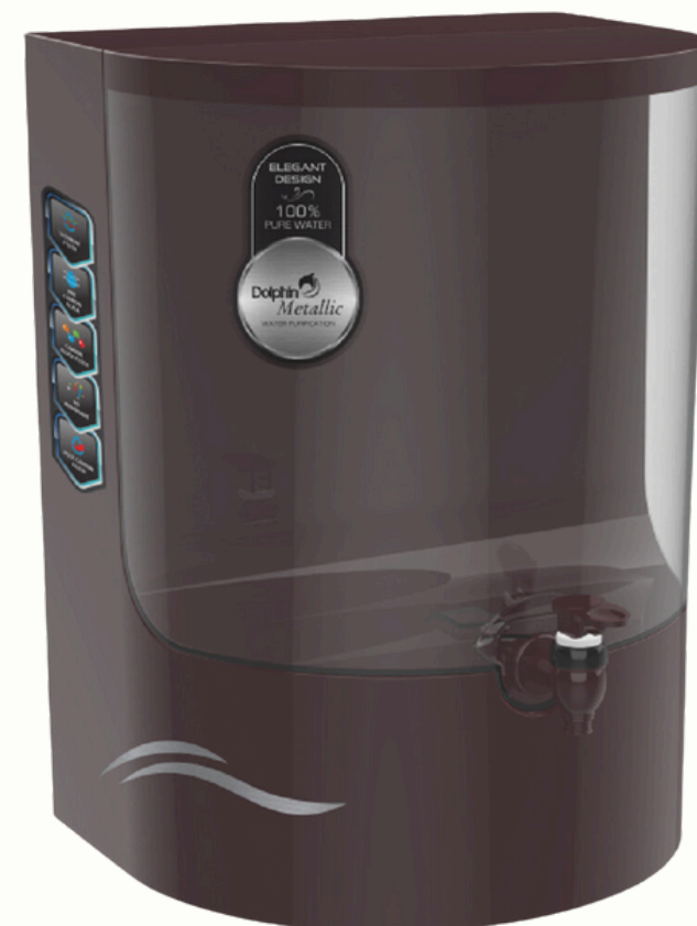
DOLPHINE METALLIC BLACK