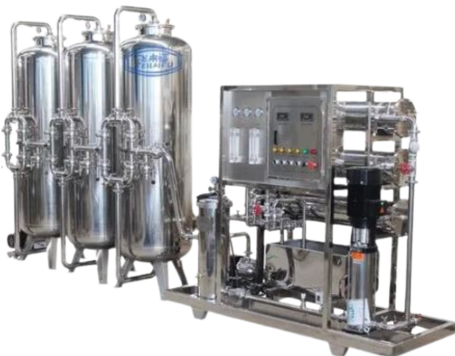
250/500/1000 Ltr SS RO Plant