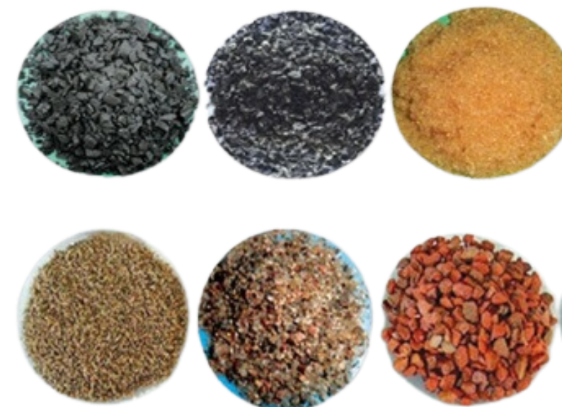
IRON Removal Medias