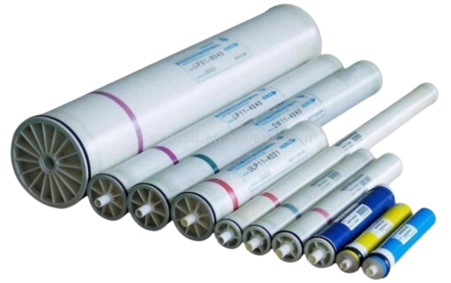
250/500/1000 Ltr Membrane