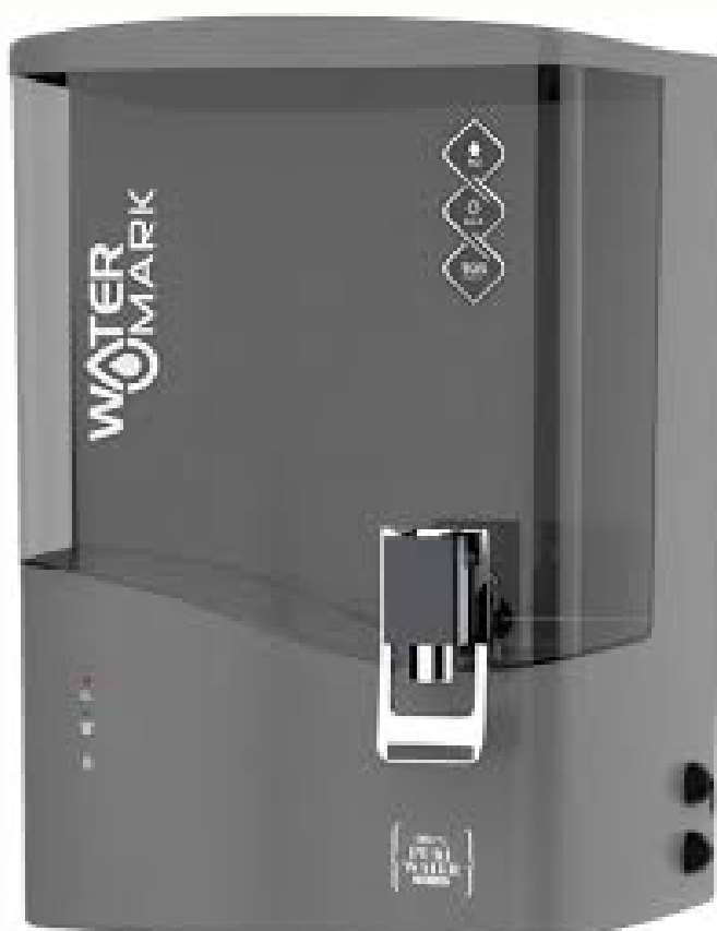
Water Mark (Premium Grey)