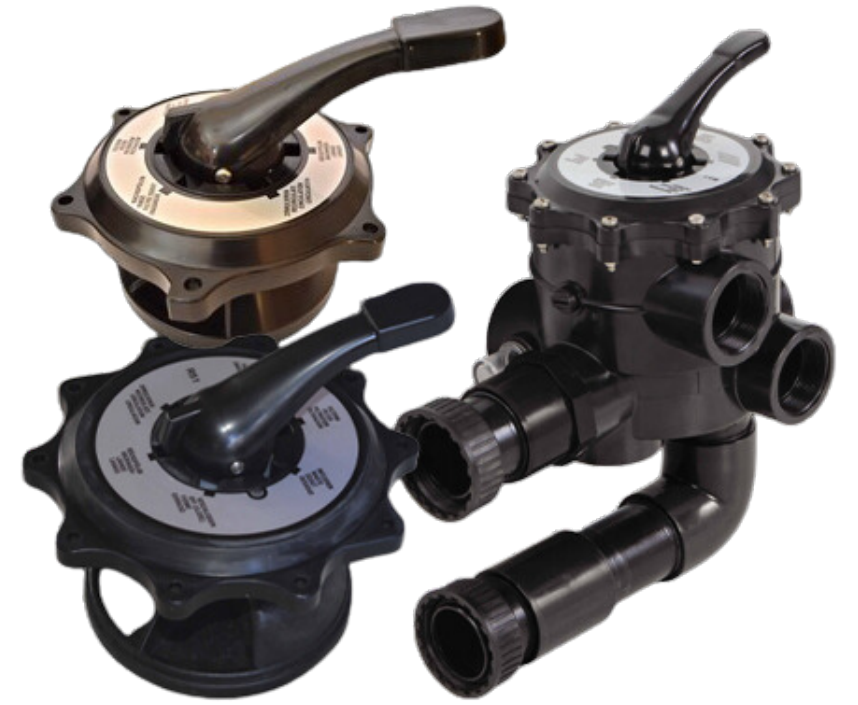
Multi Port Valves