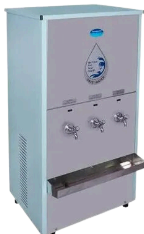
250 to 1000 Ltr Hot/Cold RO