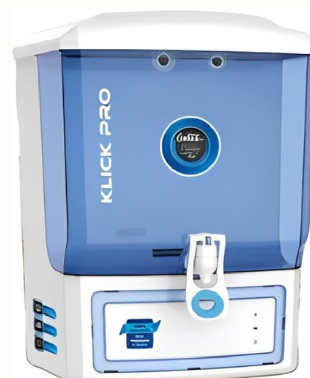
AQUA CLICK PRO