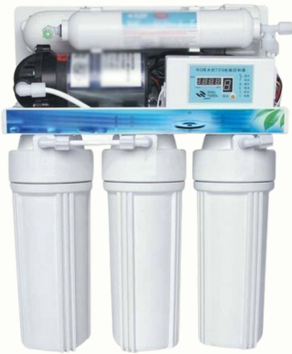
10 LPH - SS KIT