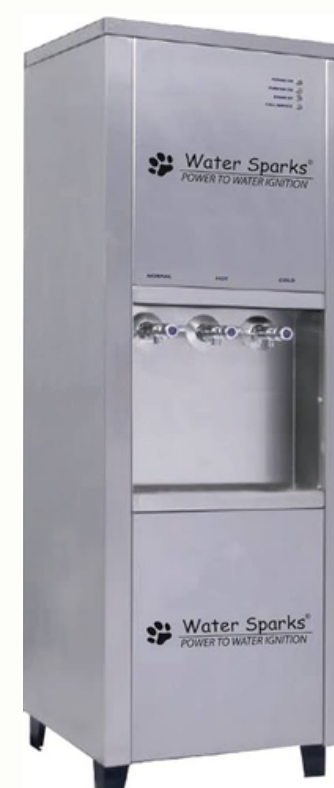
RO - HOT & COLD