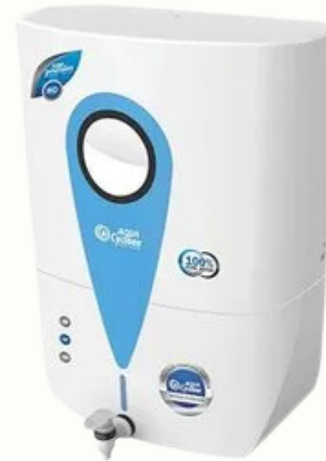
AQUA CYCLONE 01