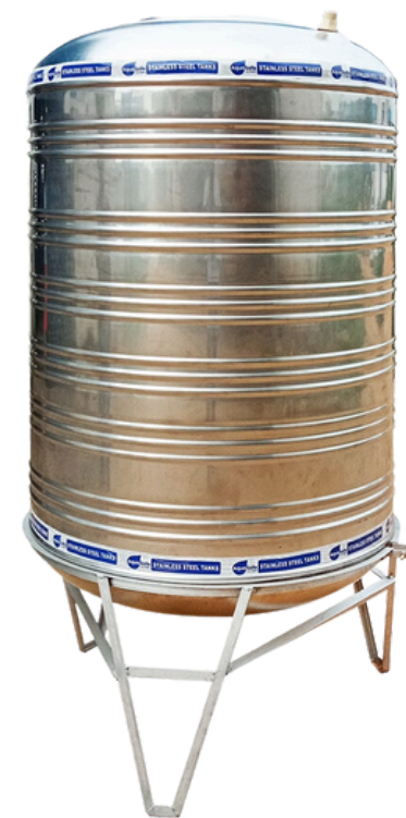
250/500/1000 Ltr SS Tank