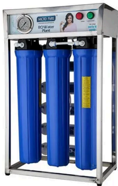
50 LPH - SS KIT