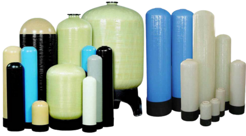
250/500/1000 Ltr Vessels