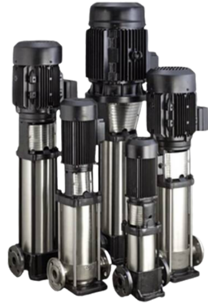
250/500/1000 Ltr Pump